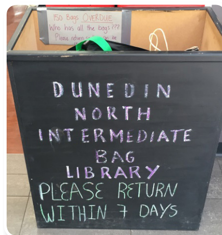
Dunedin North Intermediate School's bag library at the Gardens' New World supermarket

Many schools make re-usable bags. Dunedin North Intermediate has taken the idea a step further and set up a bag library in conjunction with the Gardens New World supermarket. A box for the bags sits at the main entrance of the supermarket. The bags have proven very popular and the school is trialling different methods to encourage people to return the bags.