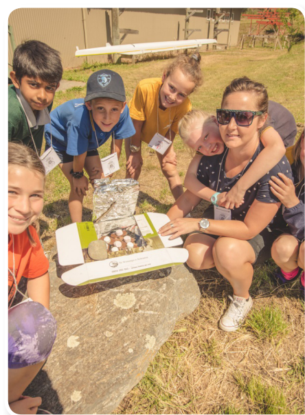
Students with their solar oven and SMORES nearly ready to eat