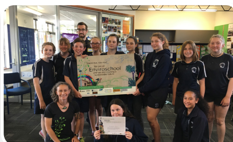
Carisbrook School on their Silver Reflection