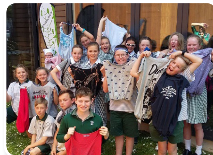
St. Gerard's and The Terrace students with their bags

Thinking about reflecting in 2018? Talk to your facilitator and set a date for it now.