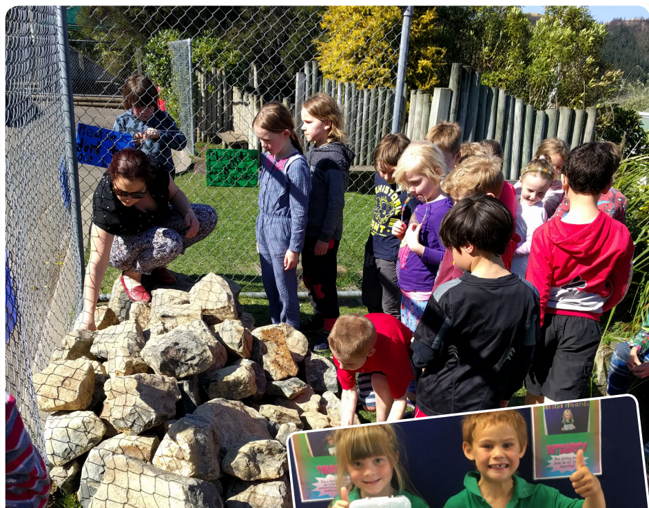
Opoho students sorting rocks for the lizard garden so school documents can now be composted.

Waste was also the theme for Bayfield College's Empowerment Fund grant. The Envirogroup has been working on a complete overhaul of the school's waste system with the aim of reducing waste as well as making sure organics, recycling and waste are sorted correctly. The grant went toward a paper shredder