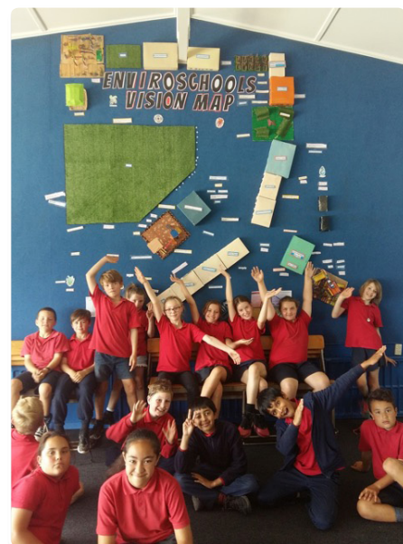
The creators of the Musselburgh School Vision map

"The visions that we have of the future affect what we think is worth doing in the present".