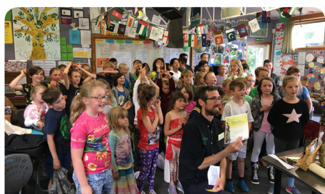
Waitati School with their Green Gold certificate

Five schools participated in the Enviro-schools hub at the Thyme festival. Redesigning our world for less waste and learning about our local biodiversity were just two of the themes covered in three very busy days. Each school brought activities to share, including work on social justice, and reusable bags made from t-shirts.