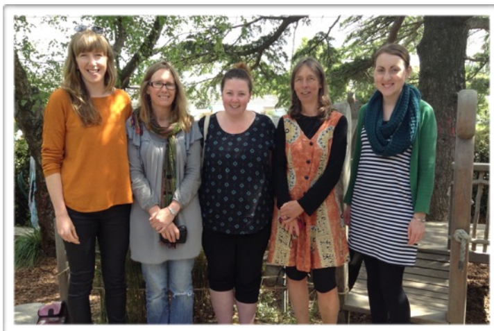
Above: ECE Teachers visiting Cherry's on Maryhill, Christchurch.

"The road trip was wonderful inspiration for all of us. I'm very excited to get back to school and share what I've learnt with my team." - Teacher