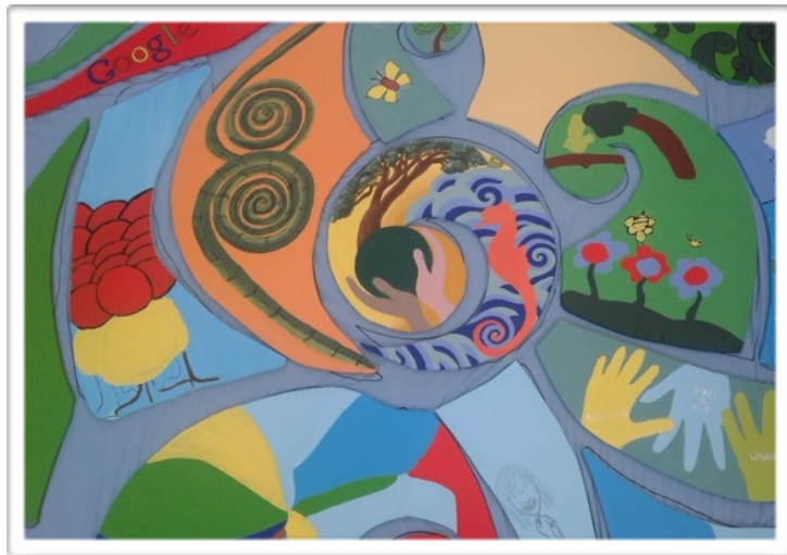
Above: Visual art installation created by Reefton Area School students