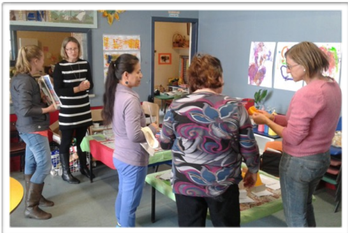
Below: Waste-free lunchbox promotion at Kidsfirst Hokitika

The Envirogroup provided some delicious waste-free lunch box fillers and informative displays including nutritional guidelines, reusable food wraps and a waste timeline. The Kidsfirst team have already noticed a reduction in non-recyclable packages in lunch-boxes.