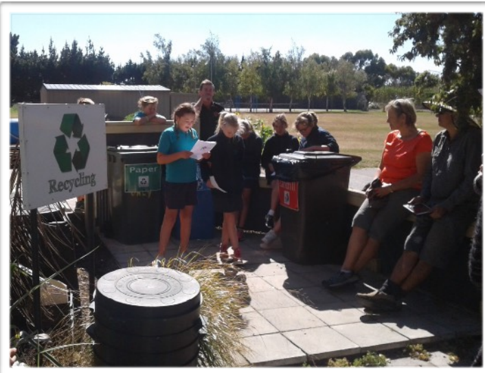
Above: Ashley School's Envirogroup running the show.

The third of three road trips for EnviroSchools Kaiako, funded by the West Coast Community Trust, took place in February. Lead teachers were led on tours by Envirogroups at 3 different Canterbury schools. "Seeing a variety of ways that schools explore and take action for sustainability was a highlight. There were lots of creative ways schools were providing robust learning for a range of students and abilities." - Teacher