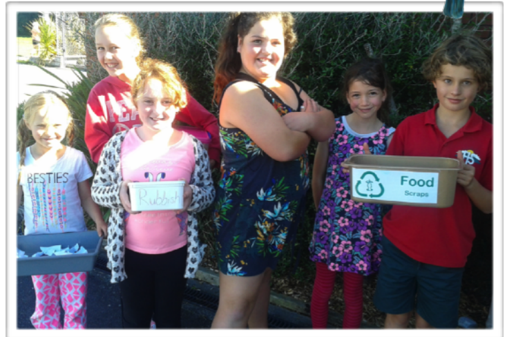
Above: Hokitika Primary's Waste Warriors.

finished off our new compost bin. There was a great deal of research and discussion that went into the design for our bin. This compost bin has been in the planning stage for nearly 12 months. All of the materials used were donated to us. One of our parents came along to give us a helping hand with the construction. We now have a fantastic new spinning compost!