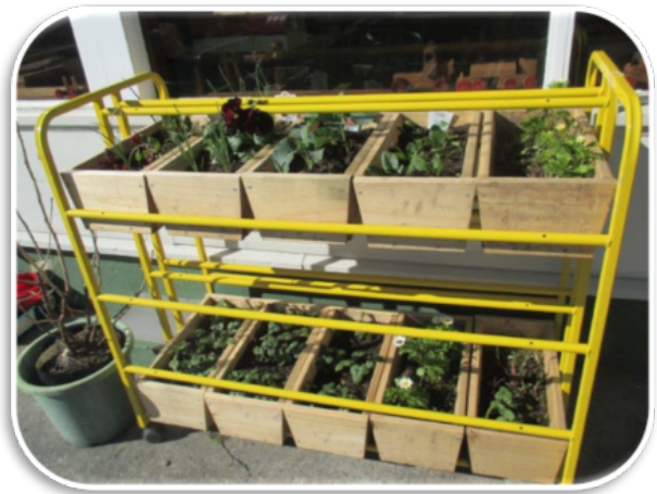
ABOVE: Planter boxes constructed by Kidsfirst Karoro children. Note the recycled library shelf!