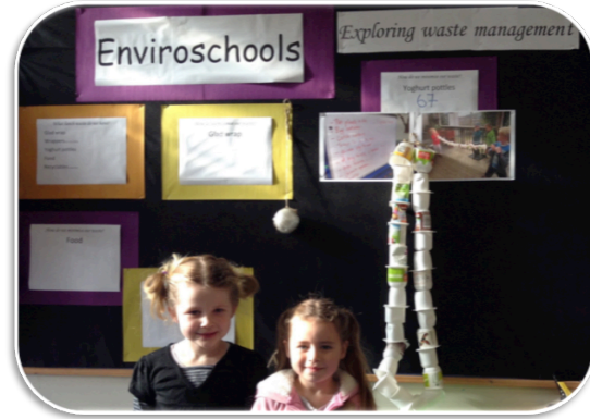
Left: Scenicland children with their yogurt pottle display

Scenicland Hokitika Nursery & Pre-school have targeted yogurt waste and packaging. The centre created an eye-catching display of one weeks worth of pottles - a whopping 67. They have decided to take action by making yogurt with the children using donated Easi-yo makers. Teachers say this has multiple benefits: less yogurt wastage, less pottles going to the landfill, less sugar and less gunk to clean up! They've also started recycling the glass baby food jars now that they know glass is reused in Westland.