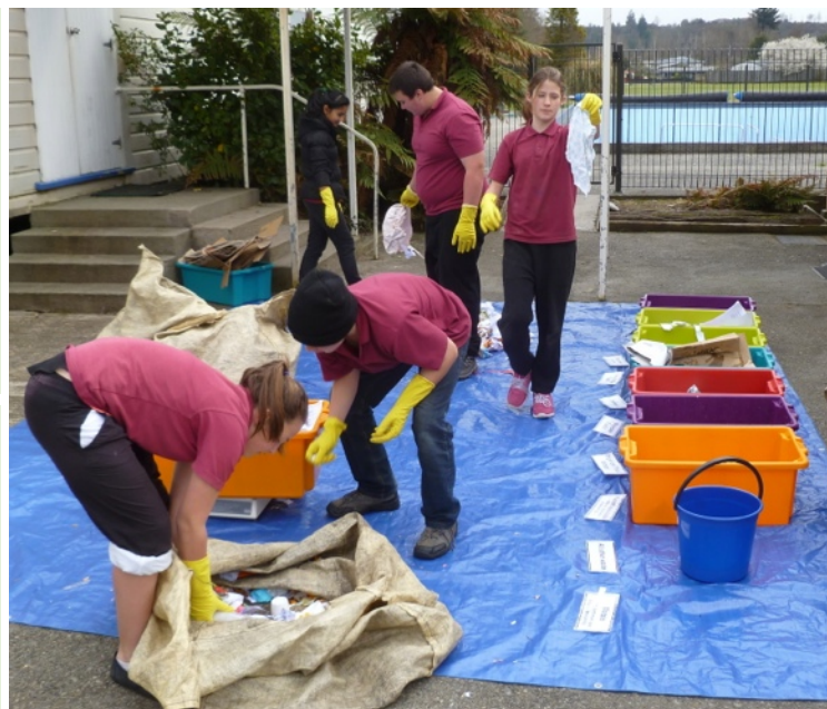
Above: Reefton Area Students conducting a waste audit

For the first time ever, the Enviroschools Foundation are carrying out a nationwide census of the actions and outcomes that are happening across the Enviroschools network. Thank you to all West Coast Enviroschools for completing the survey before the deadline - a 100% response rate. Wow-wee!