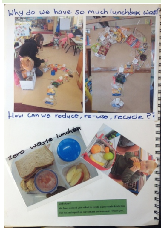
Above: A glimpse at Kidsfirst Karoro Enviroschool's Scrapbook!