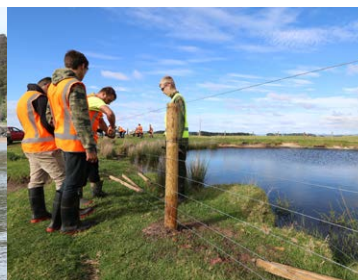
Learning sustainable agriculture skills on-farm