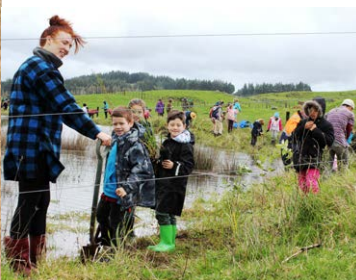
Intergenerational action for ecological restoration

“Council benefits greatly from its relationship with Enviroschools. The programme makes a significant contribution to our work across a range of teams and brings a unique holistic kaupapa into the organisation. As the council moves more into collaborative ways of working the skills held and approach taken by the Enviroschools team will be ever more valuable.” – Manager Greater Wellington Regional Council