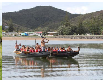
Experiencing and connecting with Mātauranga Māori