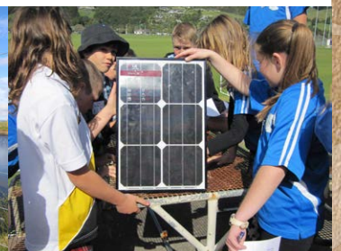
Developing knowledge in eco-building and renewable energy